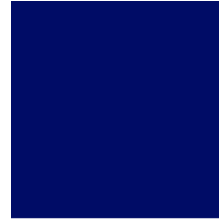
Navy Blue #000C66