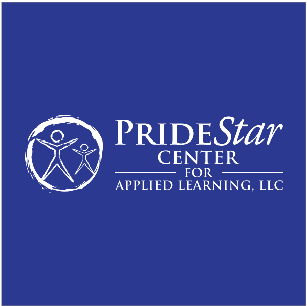
White version on blue

You should use it when your logo is included in the newspaper or in the Yellow Pages, or on any black and white laser-printed materials.