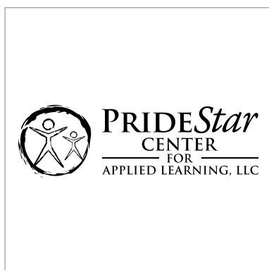
Black on white