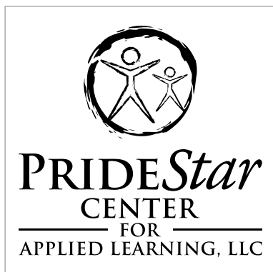
Black on white

This version should be used on faxes or any materials you reproduce using a copier. It's also the version that you should send out when you want your logo engraved.