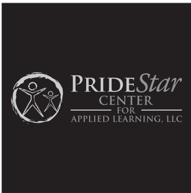
Grayscale inverted version on black