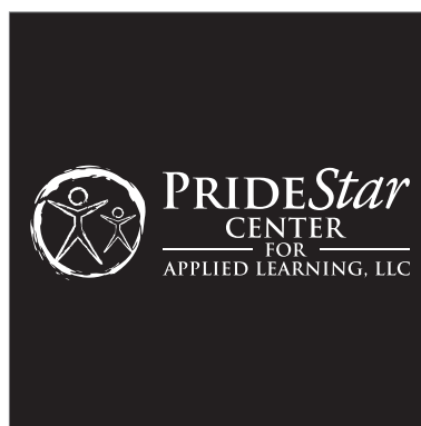
White on black