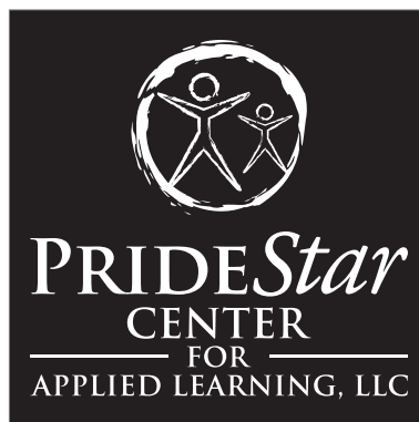
White on black