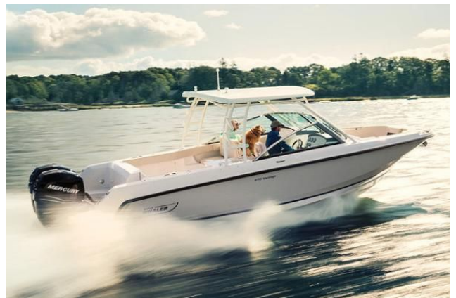
Manufacturer Provided Image

MarineMax Yacht Center, 750 South Federal Hwy, Pompano Beach, FL 33062, United States