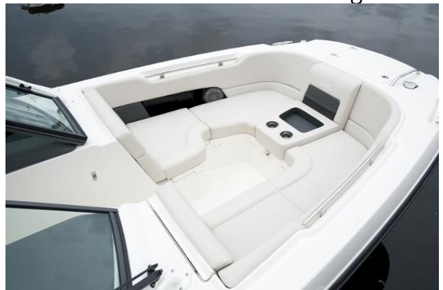
Manufacturer Provided Image

MarineMax Yacht Center, 750 South Federal Hwy, Pompano Beach, FL 33062, United States